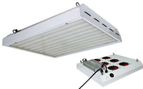
600 Watt - 24" x 22" x 6", 22 lbs