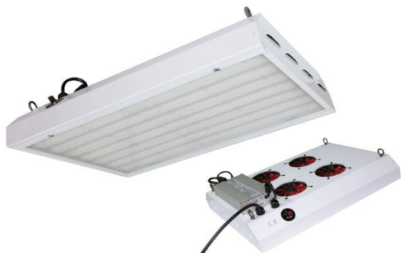
450 Watt - 24" x 18" x 6", 20 lbs